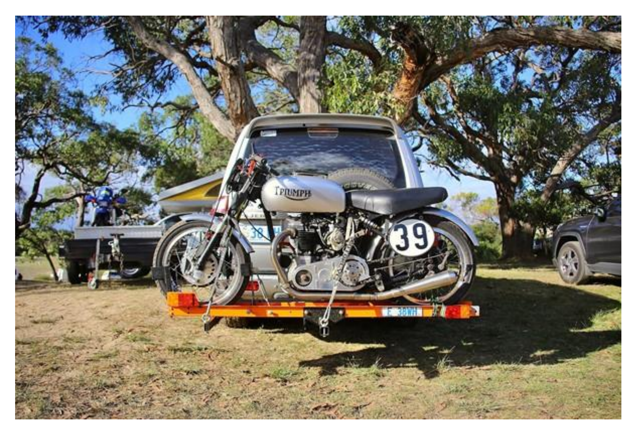
And the Triumph has to get home somehow!!!!!!