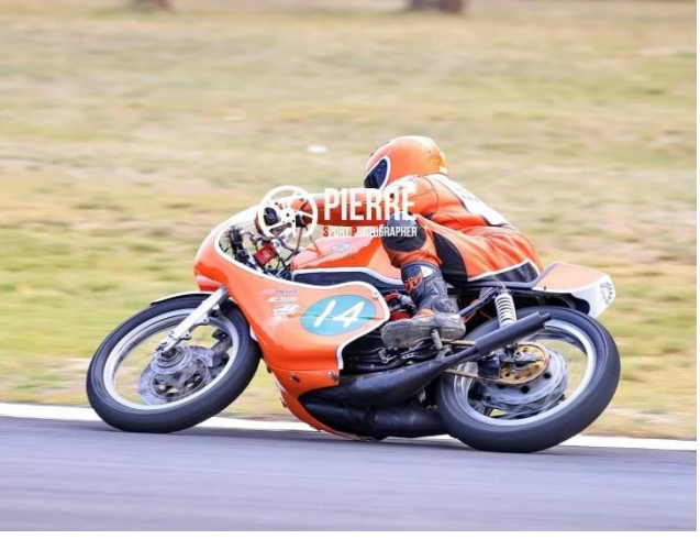
Exiting the last corner onto the start/finish straight