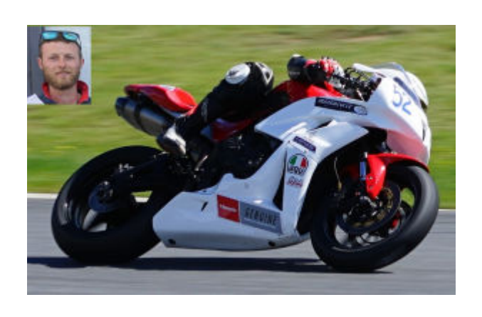
2<sup>nd</sup> Hamish Sellers:278