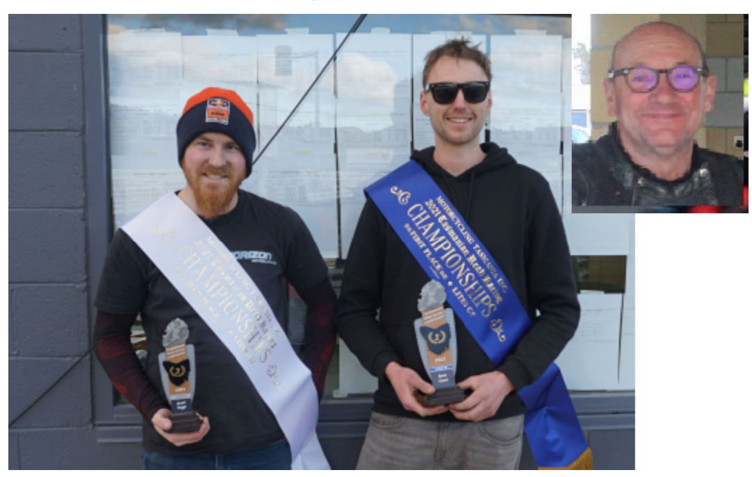
1st Taran Ocean: 307